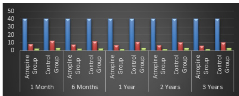
Fig. 1: Stability of ocular alignment at follow-up visits

Note: (■): n; (■): Mean PD and (■): SD PD